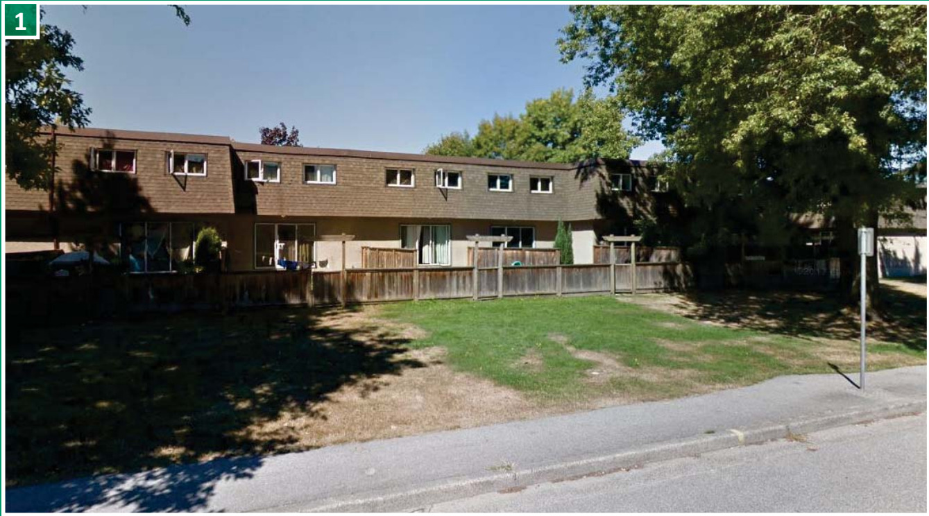
14 th Avenue