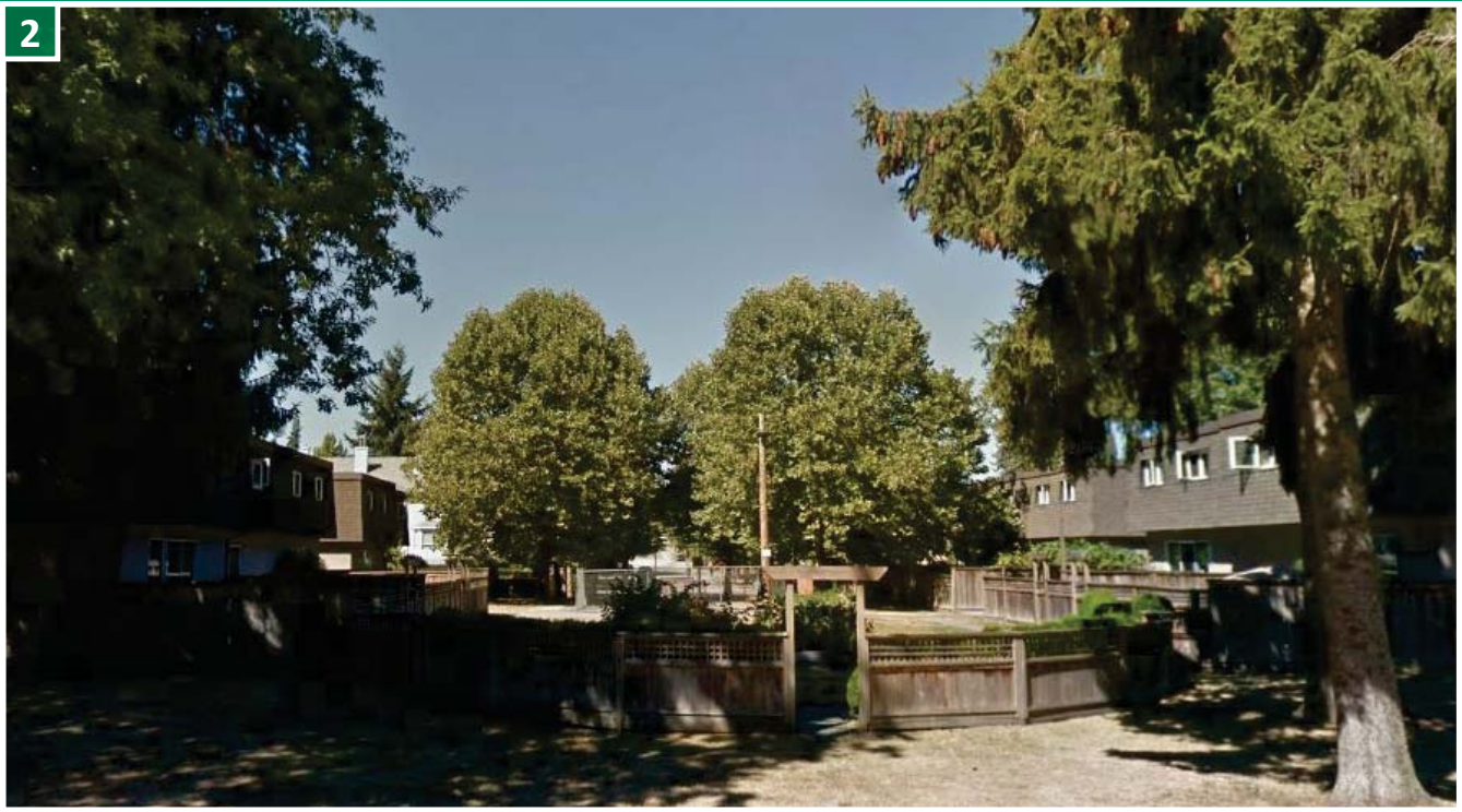
14 th Avenue