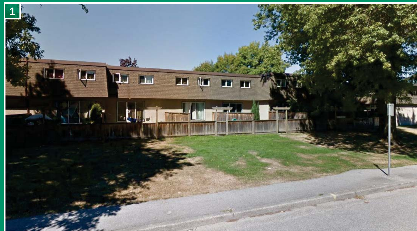
14 th Avenue