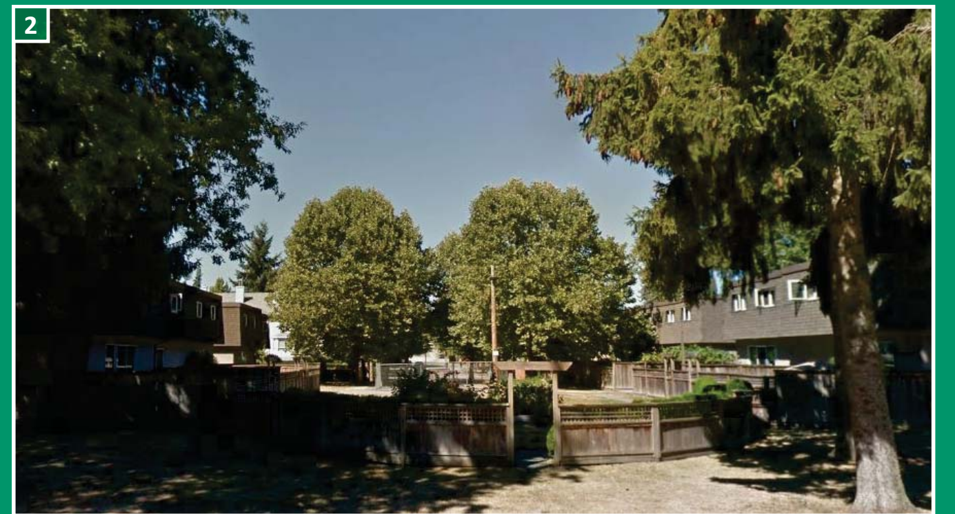
14 th Avenue